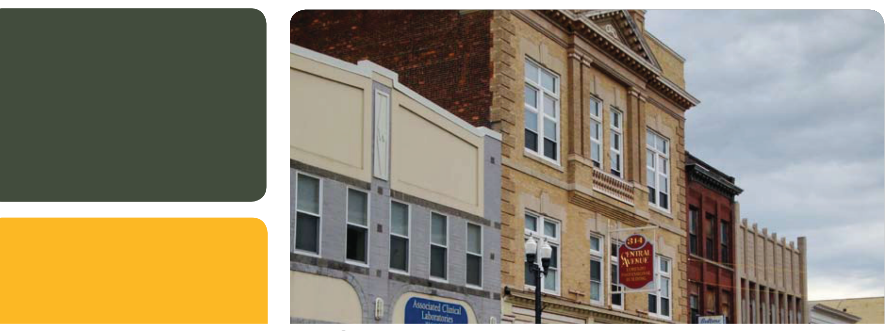
Strengths, Weaknesses, Opportunities & Threats